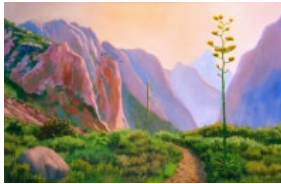
11. Big Bend Afternoon shows a late afternoon summer scene at Big Bend National Park in Texas (so named due to the big bend the Rio Grande River makes as it winds its way to the Gulf of Mexico). Dragonflies were in

great abundance while the vertical landscape seemed surreal. 24 x 36; oil/canvas; 2007; $ 950