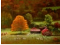
2. Westmoreland October depicts a sheep farm in a small valley near Donegal, Pennsylvania. 18 x 24; oil/canvas; 2002; $ 200