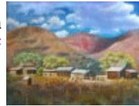
12. New Mexico Colors. Based on a scene near Lordsburg, New Mexico. 14 x 18; oil/canvas; 2005; $ 200

great abundance while the vertical landscape seemed surreal. 24 x 36; oil/canvas; 2007; $ 950