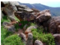
17. Forest Above the Tree Line is a beautiful little area of wild flowers I found while driving down the slope of Pike's Peak near Colorado Springs. 11 x 14; photograph; 2006; $ 175