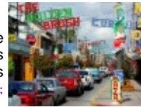
24. Acuna Rush Hour. Lunchtime broke out in Acuna, Mexico and the streets were suddenly filled. Twenty minutes later and all was quiet. 11 x 14; photograph; 2003; $ 100