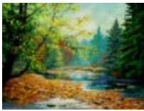
1. Cook Forest Stream was inspired after an accidental fall down a ravine where I came upon this scene at Cook Forest State Park in Clarion County, PA. 18 x 24; oil/canvas; 2002; $ 300