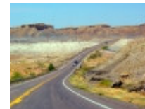
19. Do Not Pass is one of my favorite photos, taken while driving through the Navajo Indian Reservation in northeast Arizona. 11 x 14; photograph; 2004; $ 250