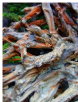
18. Rocky Mountain Roots. This view of up-turned tree roots was taken on the shore of a lake in Rocky Mountain National Park in Colorado. 14 x 11; photograph; 2006; $ 200