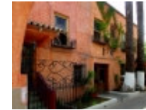
23. Side Entrance, Acuna, Mexico is a hotel in Acuna, Mexico with the most beautiful alley I think I have ever seen. 11 x 14; photograph; 2003; $ 100