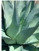
16. Jaws That Never Chew is the first thing that came to mind when I saw this Agave plant in Texas as the thorns reminded me of teeth. 14 x 11; photograph; 2003; $ 175