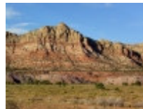
15. Flaming Cliffs. Another amazing sight on the road to the north rim of the Grand Canyon. Navajo Indians make their home among these cliffs and valleys. 11 x 14; photograph; 2004; $ 150