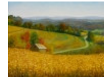
27. Westmoreland Harvest. This autumn scene is from an area northeast of Murrysville, PA. 24 x 36; oil/canvas; 2006; $ 800