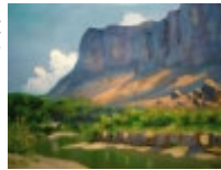
14. Rio Grande Beach. The riverbank at Big Bend National Park and our border with Mexico. The river is calm today. The opposite bank and cliffs are in Mexico. 11 x 14; oil/composite board; 2007; $ 250