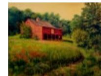
25. August Afternoon. This is based on a barn on Cherry Road in Murrysville, PA. 18 x 24; oil/canvas; 2005; $ 400