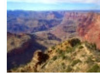
21. East Grand Canyon was taken from a point on the eastern side of the Grand Canyon called "Desert View". It is one of my favorite vantage points to see this wonderful canyon in Arizona. 11 x 14; photograph; 2004; $ 175