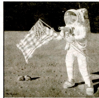
Old Glory on the Moon

travels across America. Besides landscapes and portraits, his other paintings are as varied as his many interests, including ancient American Indian artifacts and pottery as still lifes, aircraft, astronomy and paintings of manned and unmanned spacecraft.